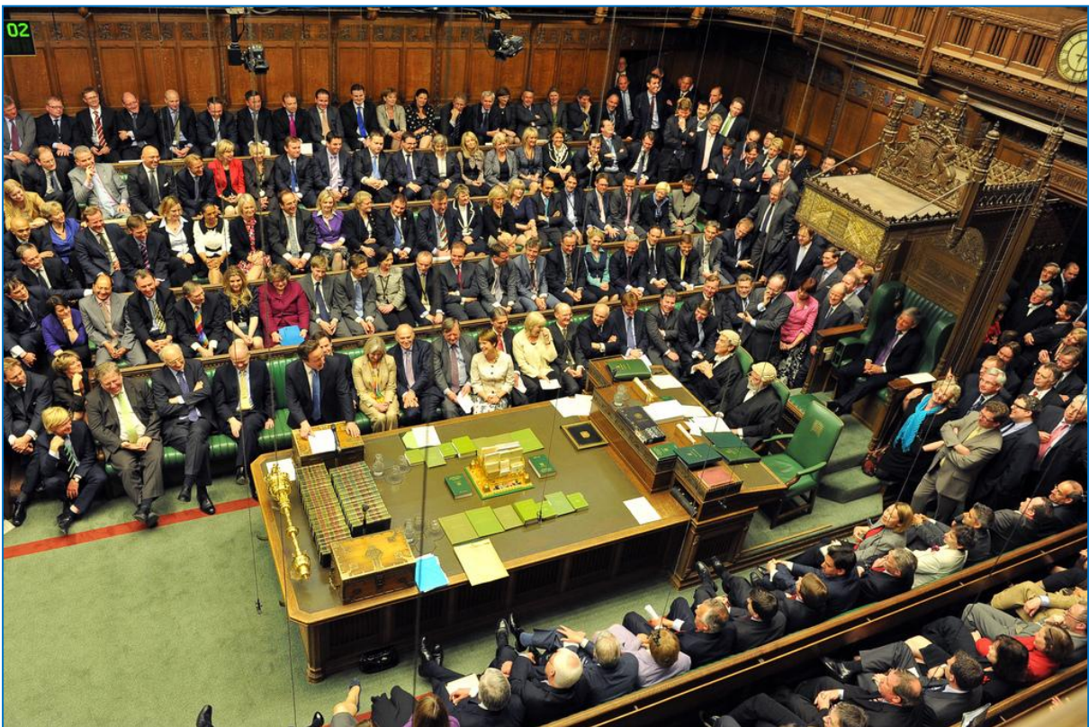
Parliamentary copyright images are reproduced with the permission of Parliament

Aims: To consider the reasons behind the UK's decision to invade Iraq in March 2003 and to understand the need for a parliamentary debate on the proposed military action.