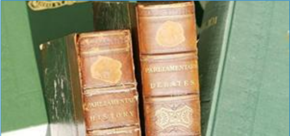
Parliamentary copyright images are reproduced with the permission of Parliament

Aims: To use a treasure trail activity to familiarise students with the layout and navigation of material related to environmental politics which is available on the UK Parliament.