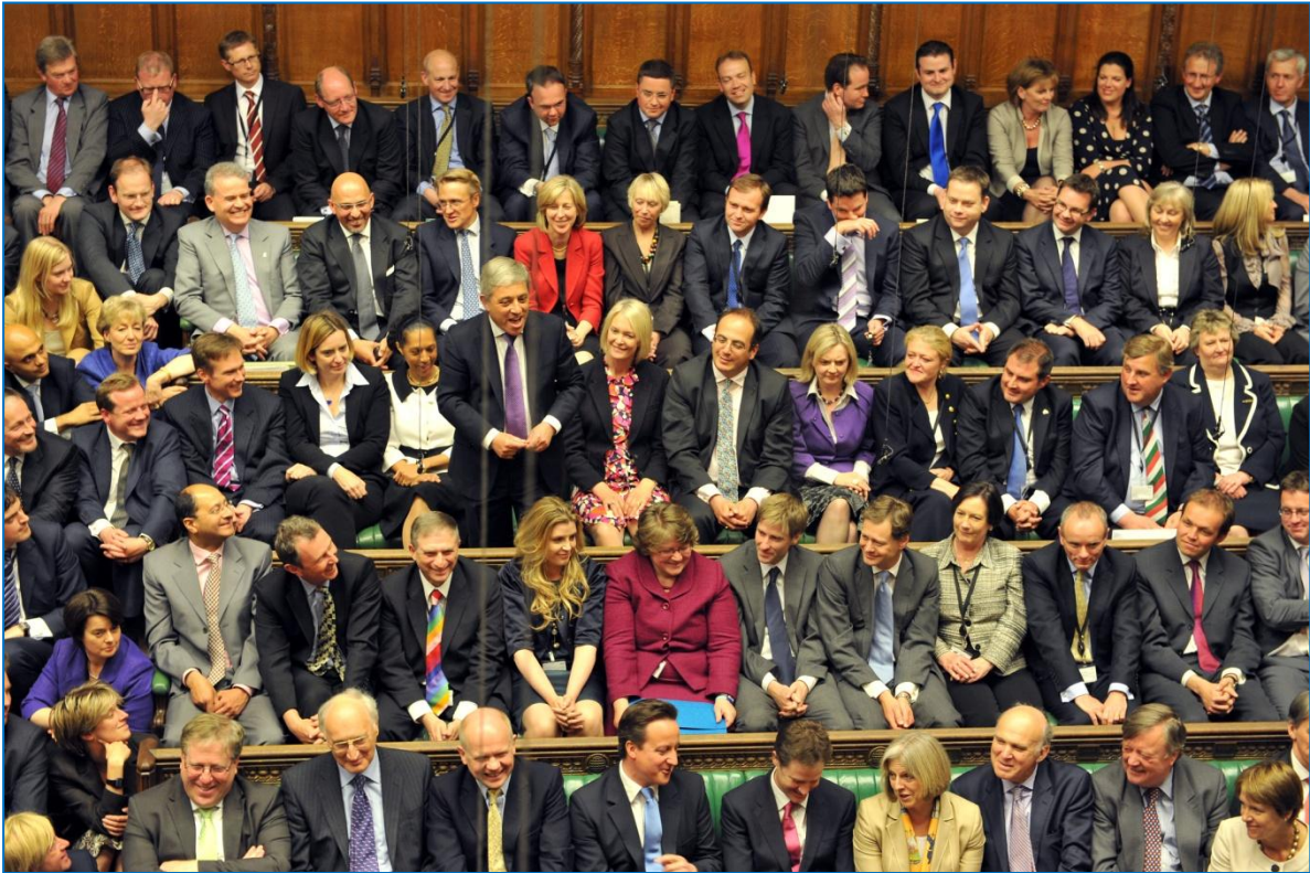
Parliamentary copyright images are reproduced with the permission of Parliament

Aims: To introduce students to the role and function of Members of Parliament.