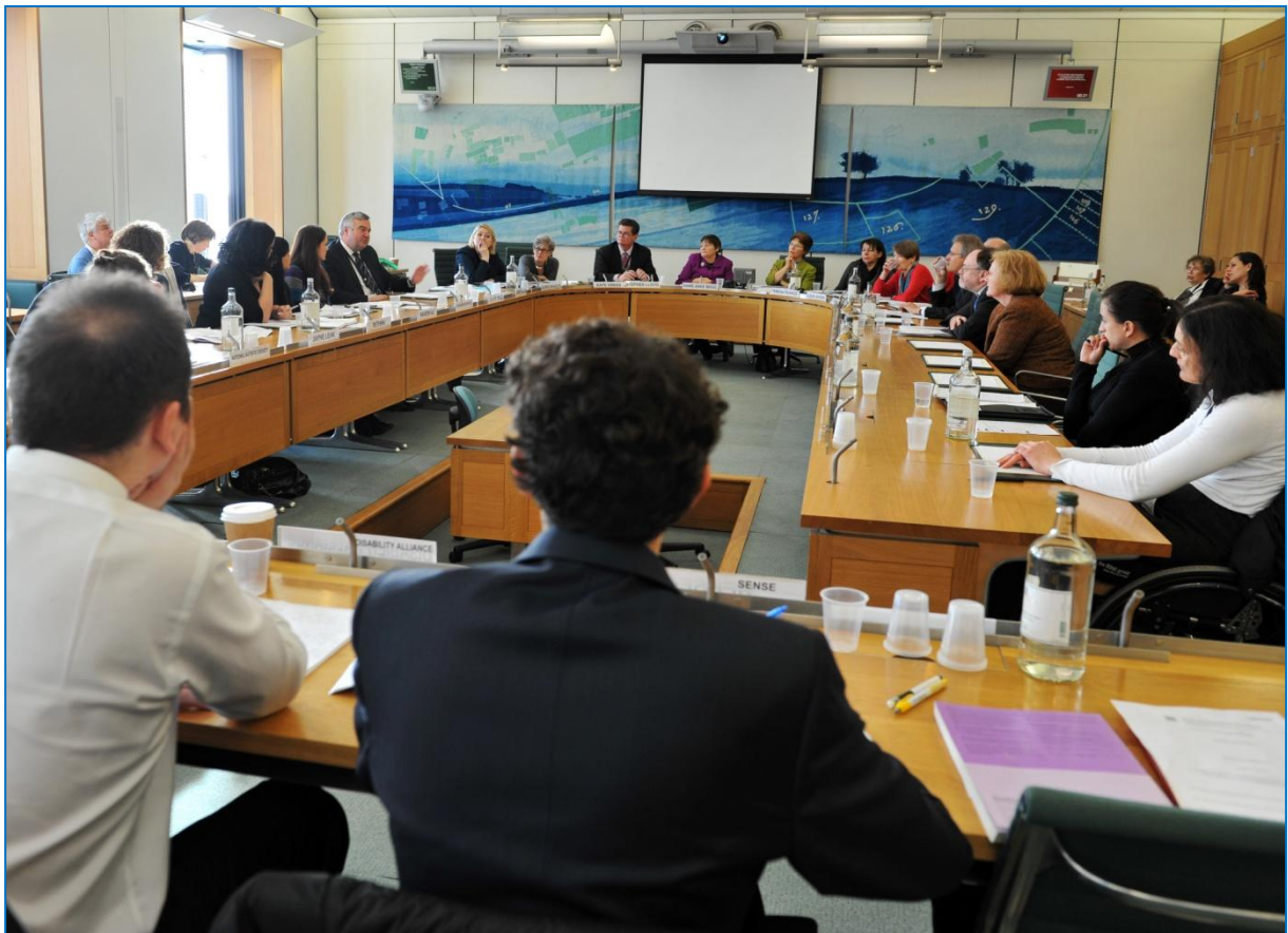
Parliamentary copyright images are reproduced with the permission of Parliament

Aim: To introduce students to the key issues in national security strategy through a select committee role play.